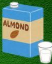
Non-dairy milk (shelf stable)