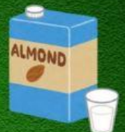
Non-dairy milk (shelf stable)